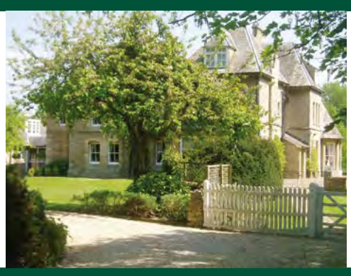
Private property but can be seen from the road.

This three-storey Cotswold stone structure was probably built around 1830. The building has uniform rows of stone arch-headed windows and loading doors on each floor. A map of 1840 shows a long range of buildings here including weaving shops, outbuildings, a house, yard and gardens.