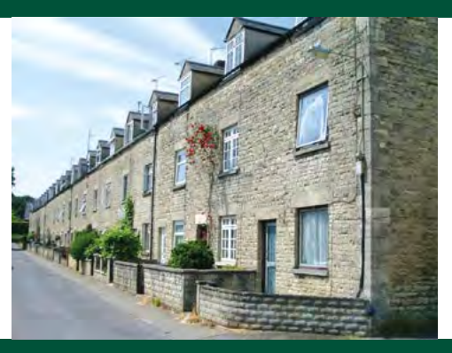
Private property but can be seen from the road.