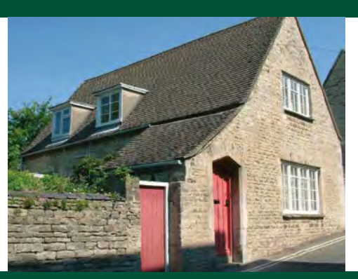
Private property but can be seen from the road.

Weavers Cottage dates back to the 18th century and was originally a group of three weavers' cottages. Each cottage would have had a loom set up in the lightest room which was operated by the weaver, who lived there with his family.