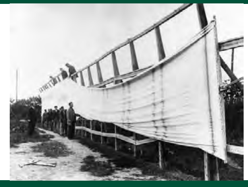
Accessible all hours.

In the past it would have been a familiar sight to see row upon row of blanket-drying racks in the fields around Witney. Blankets were not woven individually but in stockfuls, the amount that would fit into the fulling mill's stocks. This was usually equivalent to about twenty four blankets in one piece.