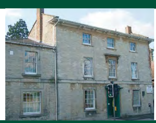
Private property but can be seen from the road.

Meadow land, like this, was essential to the medieval farming economy. Not only did it provide grazing but especially hay to keep animals over the winter. Here you would have found the local breed of sheep, another important factor in Witney's success. The 'Cotswold Lions' had developed over the centuries from animals that were a cross between native Iron Age sheep and a breed that the Romans introduced to Britain. They had a distinctive woolly 'topknot' on their heads but more importantly they produced a long, fine wool that was much in demand from the early medieval period, especially for export.