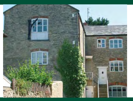
Private property but can be seen from the road.