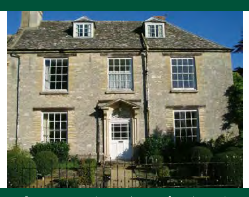
Private property but can be seen from the road.