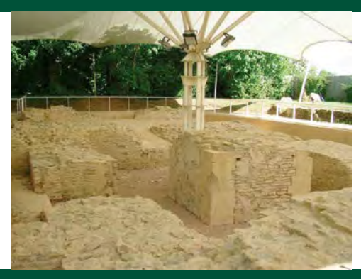
Monday to Friday 10am - 5pm

The remains of the 'Bishop's Palace' are situated in the grounds of Mount House, just east of St Mary's Church. In reality the 'palace' was a manor house, one of the earliest and largest of its type, the working centre of the estates owned by the Bishops of Winchester. Archaeological excavations have revealed a series of stone buildings arranged around a courtyard and surrounded by a wall and moat.