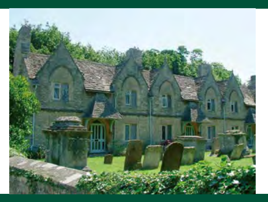
Private property but can be seen from the road.