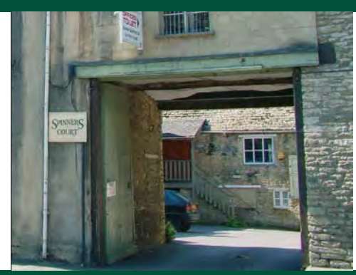
Private property but can be seen from the road.

A three-storey L-shaped building of coursed limestone with red-brick arches to the window heads (each with stone keystones) and a slate roof. An iron crane is still fixed to the top storey of the gable end wall facing the street. 'Captains' probably dates from the early or mid-19th century. Initially it was used as a handloom weaving establishment, with storage and warehousing on the upper floors. It was still shown as a 'Blanket Factory' on the 1899 Ordnance Survey map, but it was later used as a warehouse. It has now been converted into housing.