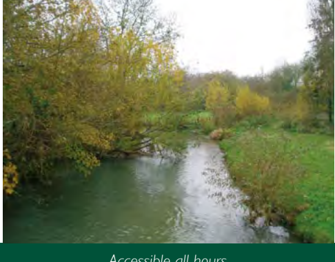
Accessible all hours.