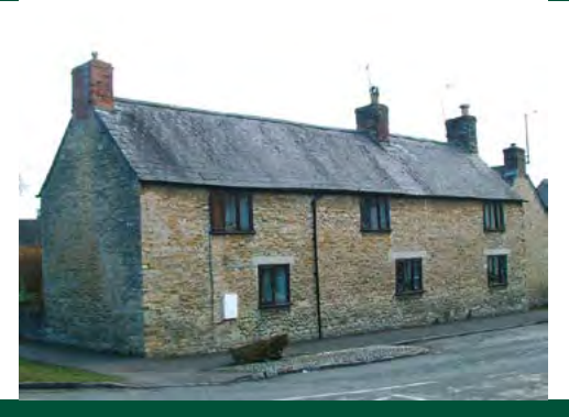
Private property but can be seen from the road.