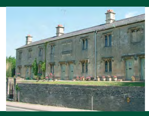
Private property but can be seen from the road.