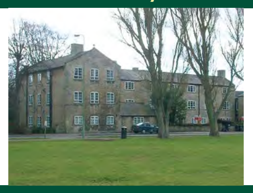
Private property but can be seen from the road.