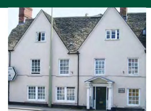
Private property but can be seen from the road.