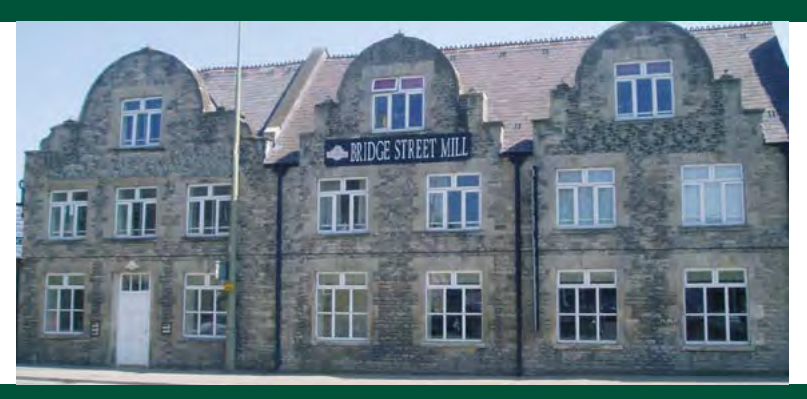
Private property but can be seen from the road.

Bridge Street Mill was made up of a range of different stone and brick buildings that grew up gradually over time, the earliest mill building probably dating to the early 19th century. In 1899 the nine-bay façade, with its three Jacobean style gables, was built, screening the earlier buildings from Bridge Street and giving it a uniform appearance. The complex was quite large, the Cotswold stone buildings that ran south-east from the street being about 280 feet long. William Smith started production here, around 1866. Although sited very close to the river the mill never used water power as William Smith's policy from the start was to use steam. The boiler house and engine were sited near to the mill entrance, power being transmitted to different areas of the mill by means of shafting and belt drives. Steam power gave way to electricity in 1948.