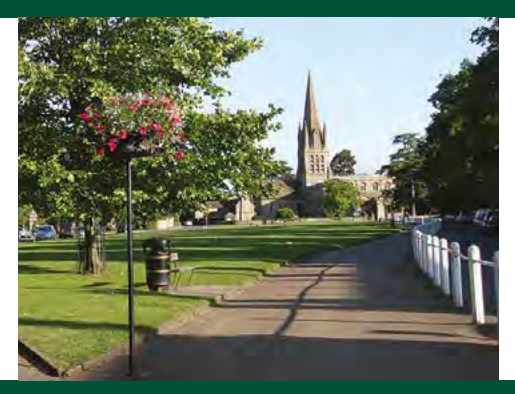
Accessible all hours.